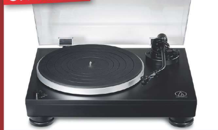
Audio-Technica's AT-LP5X direct-drive turntable