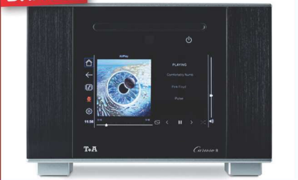
Standing ovation for T+A's Caruso R music player